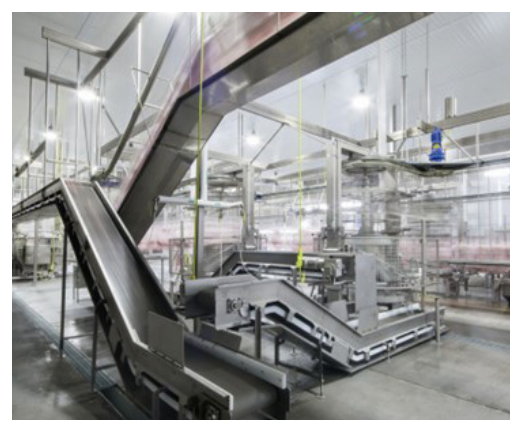
Virginia Poultry Growers